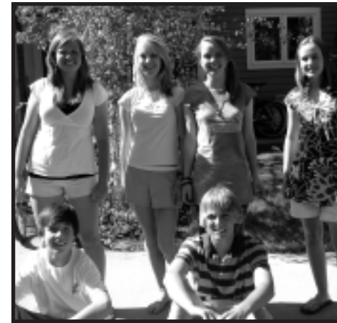
"Kids for Kids" high school members