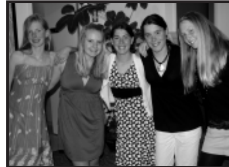
Congratulations to our senior confirmation class!